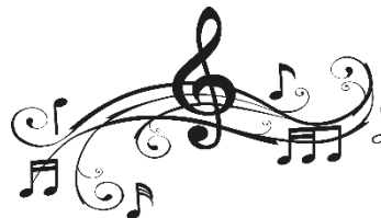
This Photo by Unknown Au-

square singing together as the Christmas lights are turned on. A new special decoration is a beautiful 10-foot Christmas light tree made by Doug Witman, a local farmer. Plan to come and sing carols together with your neighbors and enjoy the new square decorations.