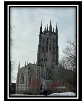
Bryn Athyn Cathedral

This is a fundraiser for the historical society so come out and support the MHS— Invite a friend!