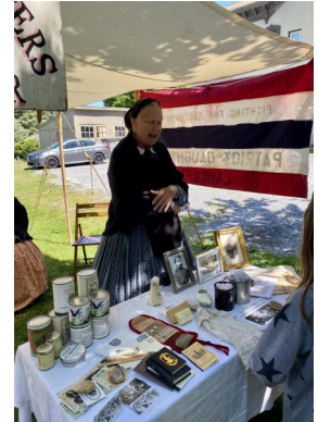
The Patriot Daughters of Lancaster.

The Picnic scheduled for June 15 has been postponed to a later date. Watch for details!